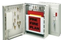
Knox Cabinet Model 1302 and 1304

Surface mounted with a single lock and a 5 or 7 inch depth. Model 1304 is equipped with a tamper switch.