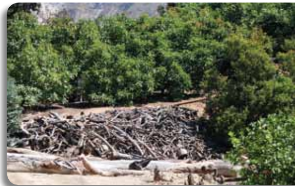
Dead trees and orchards overgrown with weeds can carry a fire deep into a grove, damaging both fruit and trees.