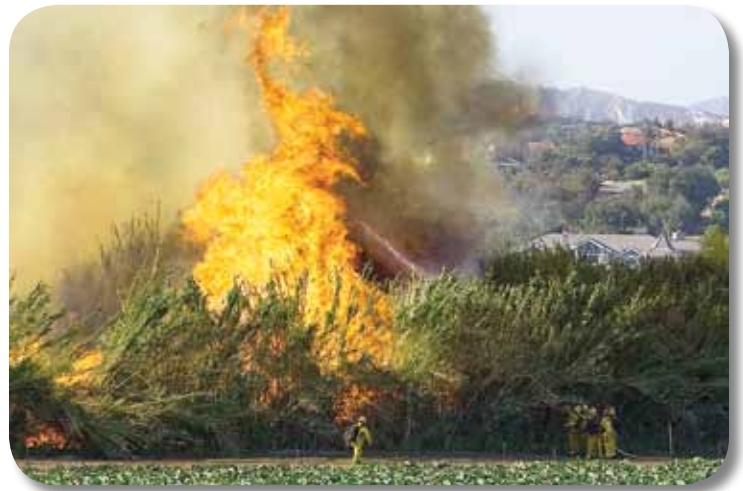
Row crops are not usually at risk from wildfires, but firefighters often access the fires through fields near natural vegetation.