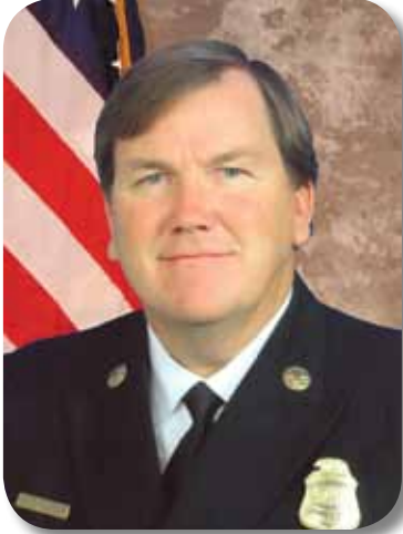
Bob Roper, Ventura County Fire Chief

A griculture is a key component in the economy of Ventura County. The crops and livestock grown by the county's farmers, ranchers and growers have an annual value of almost $2 billion. The farms and ranches employ thousands of people and the industries that support them – packing houses, trucking companies and others – employ thousands more. Protecting the county's agricultural assets is a key goal of the Ventura County Fire Department.