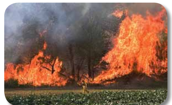
Radiant heat from wildfires generally only threatens the outside rows of crops being grown in the field. But embers can attack farm equipment and supplies.