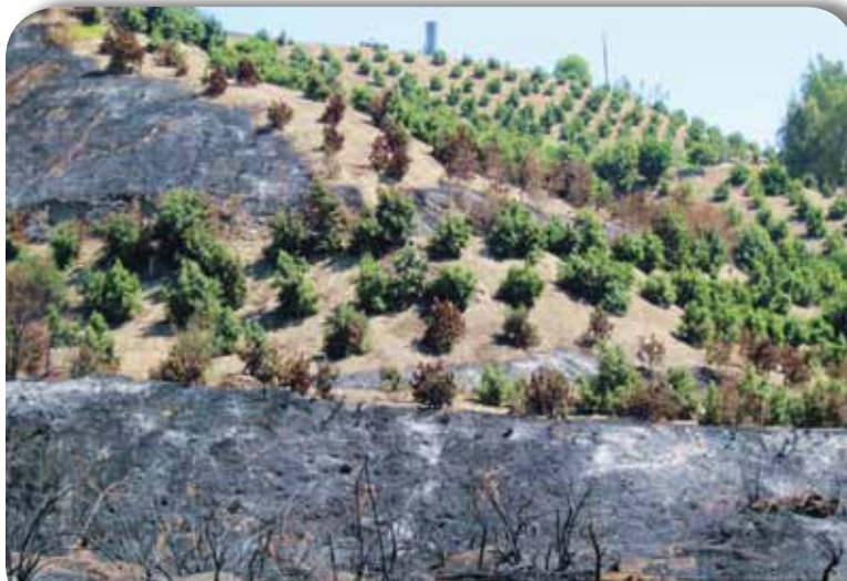
Trees and fruit can be damaged by direct flame contact or radiant heat.

dead trees, etc.); orientation to the wind; surrounding natural vegetation; and topography. The department will work with individual growers to help them determine the best methods for providing defensible space on their property.