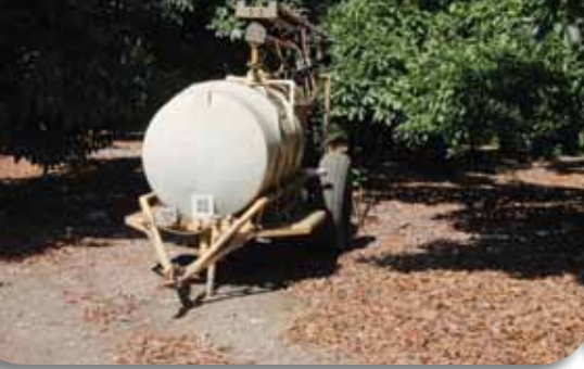
During times of high fire danger, equipment should be moved to an area clear of vegetation. Grass, leaf litter and other combustibles can carry a fire into equipment.