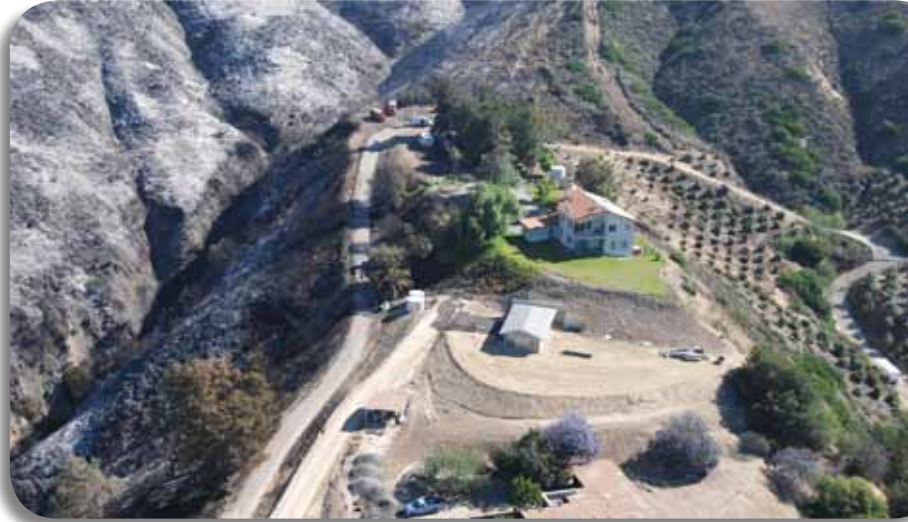
Defensible space around the property can help protect homes, barns and agricultural assets.

Ready, Set, Go! begins with property that firefighters can defend.