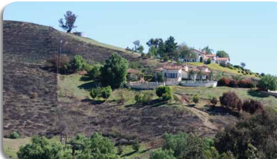
Fire-resistant construction along with defensible space can help protect against ember intrusion.