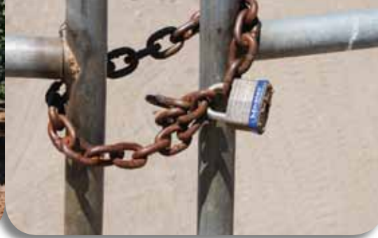
Locked gates can prevent livestock from escaping an advancing wildfire and slow down the response of firefighters.