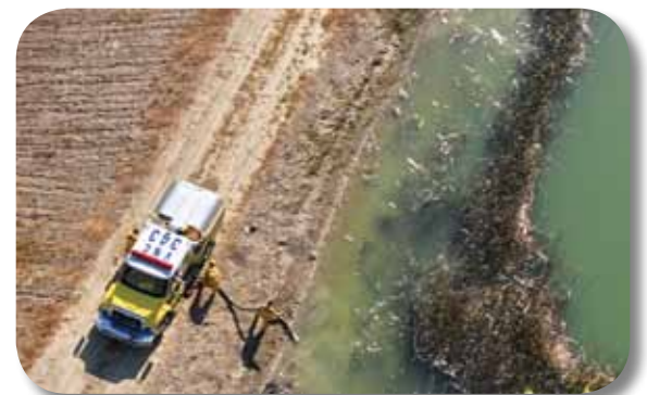
Clearly mark water tanks, hydrants and ponds so firefighters can use them to protect the property.

info@vcar.us 600 Aviation Dr. Camarillo, CA 93010 (888) 223-7387