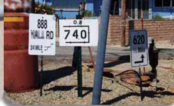
Signs and maps can help firefighters from other jurisdictions find difficult to locate addresses.